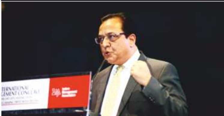
Mr. Rana Kapoor, Founder & CEO - Yes Bank addressing at IMA's 24th International Management Conclave 2015.