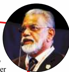
Dr. K. Radhakrishnan

I am greatly honored to be with IMA and the great team. I wish you the very best in your new endeavor. Going to the next level of excellence after a journey of 5 decades - be a role model for any professional organization in the world.