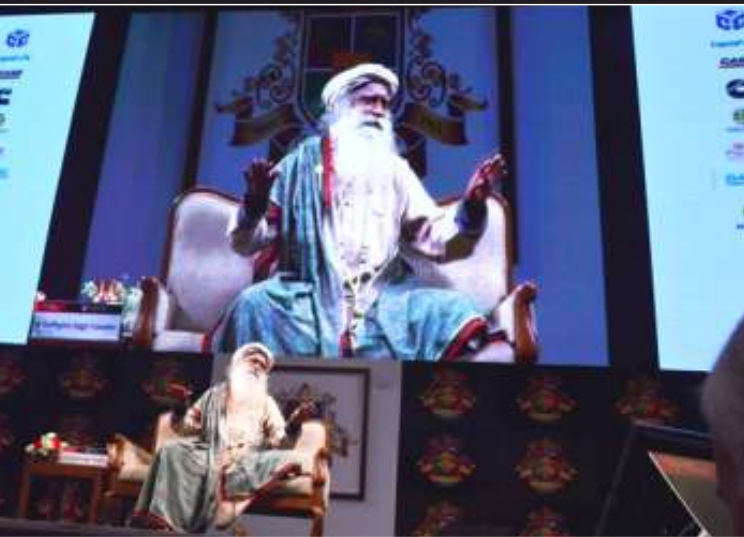
Sadhguru Jaggi Vasudev addressing at IMA's 24th International Management Conclave 2015.