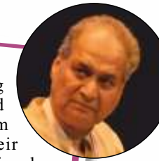
Mr. Rahul Bajaj

IMA is doing outstanding work for business and management education. I am grateful to them for their invitation to the International Management Conclave. My sincere thanks.