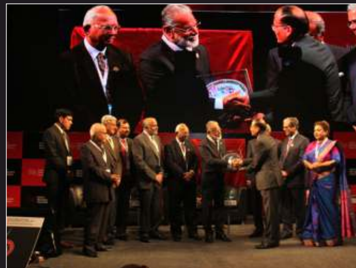
Award Ceremony: IMA Dignitaries presenting IMA Lifetime Outstanding Innovation Award 2015 to Dr. K Radhakrishnan - Former Chairman ISRO.