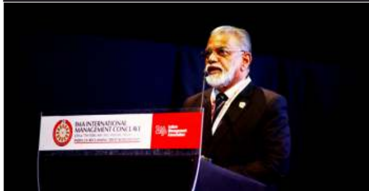
Dr. K Radhakrishnan - Former Chairman ISRO addressing at IMA's 24th International Management Conclave 2015.