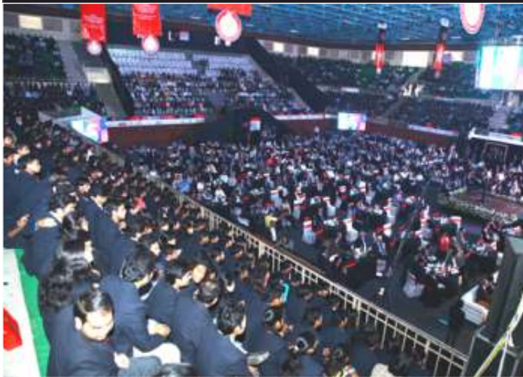
The Audience at IMA's 24th International Management Conclave 2015. (Management Students)