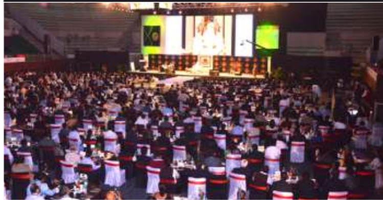
The audience at IMA's 24th International Management Conclave 2015.