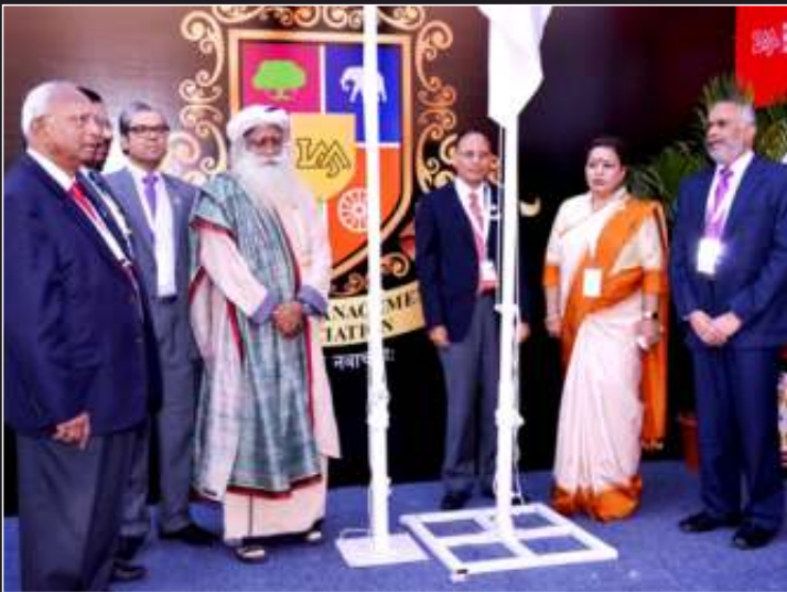
Sadhguru Jaggi Vasudev along with other IMA dignitaries during the flag hosting ceremony at IMA's 24th International Management Conclave 2015