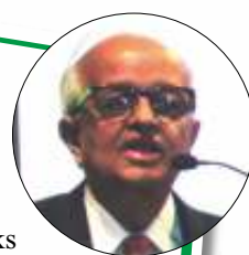
Dr. Bimal Jalan

Excellentlly orga nized conclave and thanks to IMA for giving me this opportunity. With best wishes.