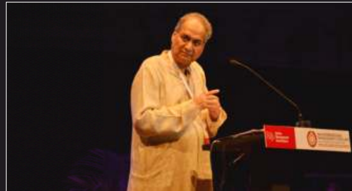
Mr. Rahul Bajaj - Chairman, Bajaj Group addressing at IMA's 24th International Management Conclave 2015.