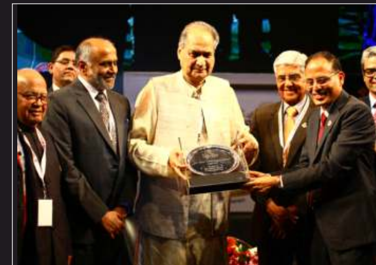
Award Ceremony: IMA Dignitaries presenting IMA Lifetime Outstanding Achievement Award 2015 to Mr. Rahul Bajaj - Chairman, Bajaj Group

Dr. K Radhakrishnan was felicitated by IMA Life Time Outstanding Innovation Award 2015 by IMA Dignitaries. The title "Mangalyanan" was also given in honor. He inspired all by sharing his life experiences and the hard work behind MOM's success story. He advised students to have multiple role models and learn from them. He made students understand the significance of learning from both failures & successes for excellence in life.