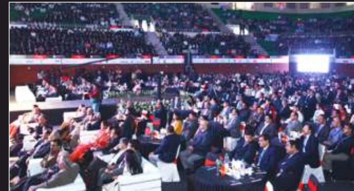
The Audience at IMA's 24th International Management Conclave 2015. (Corporate Delegates)