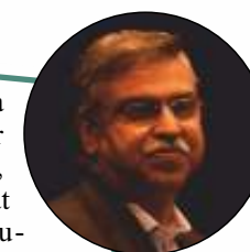
Mr. Sunil Kant Munjal

This conclave is a great idea and brings together students, business leaders, economists and thinkers at one platform. Congratulations and keep it up. Continue to build and promote the management culture in Indore and in the region.