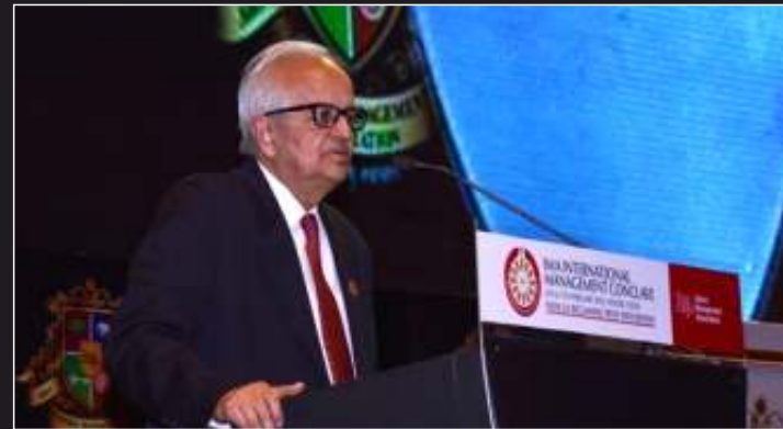
Dr. Bimal Jalan, Former Governor - Reserve Bank of India addressing at IMA's 24th International Management Conclave 2015.